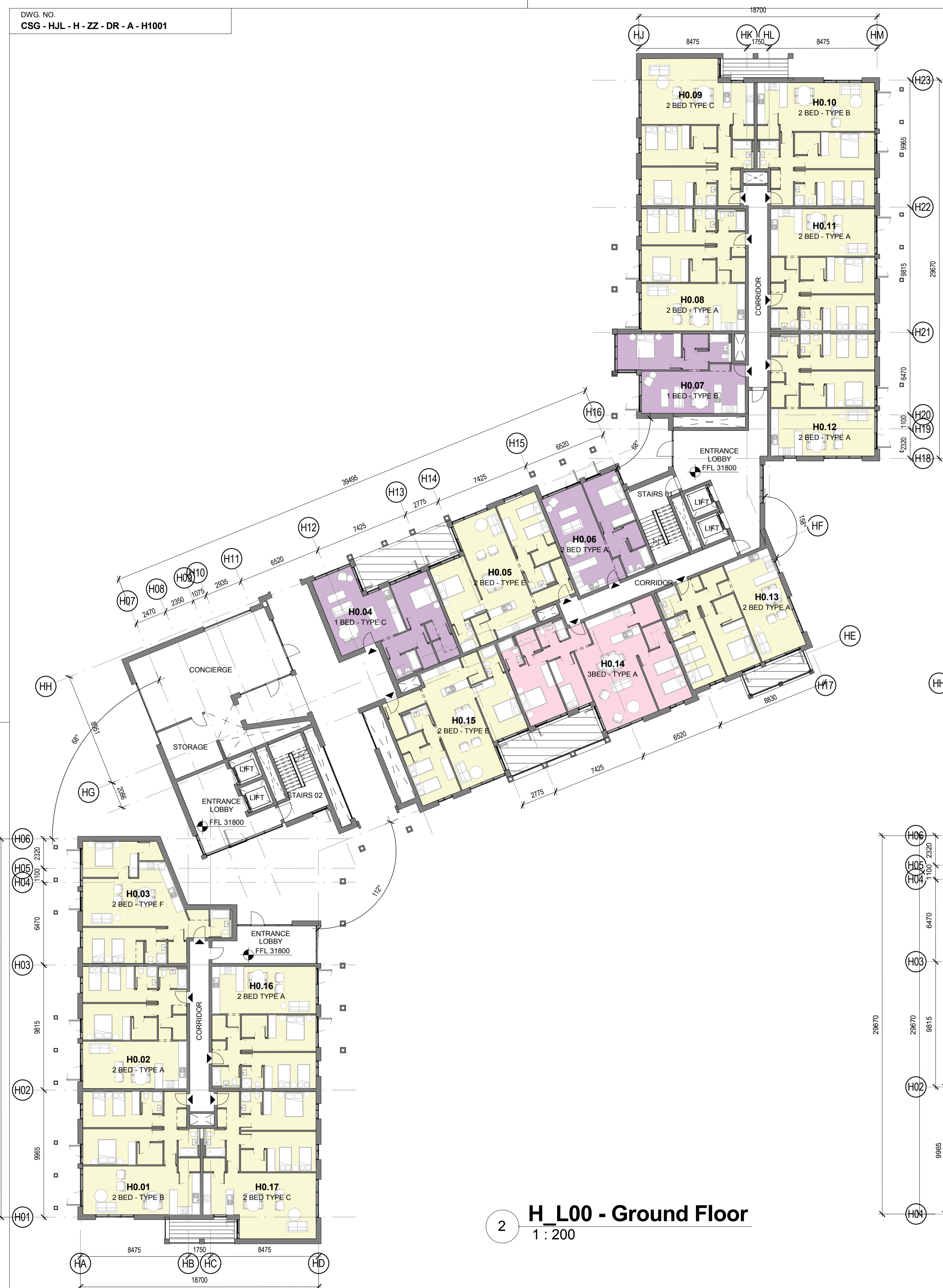
2 H_L00 - Ground Floor 1 : 200