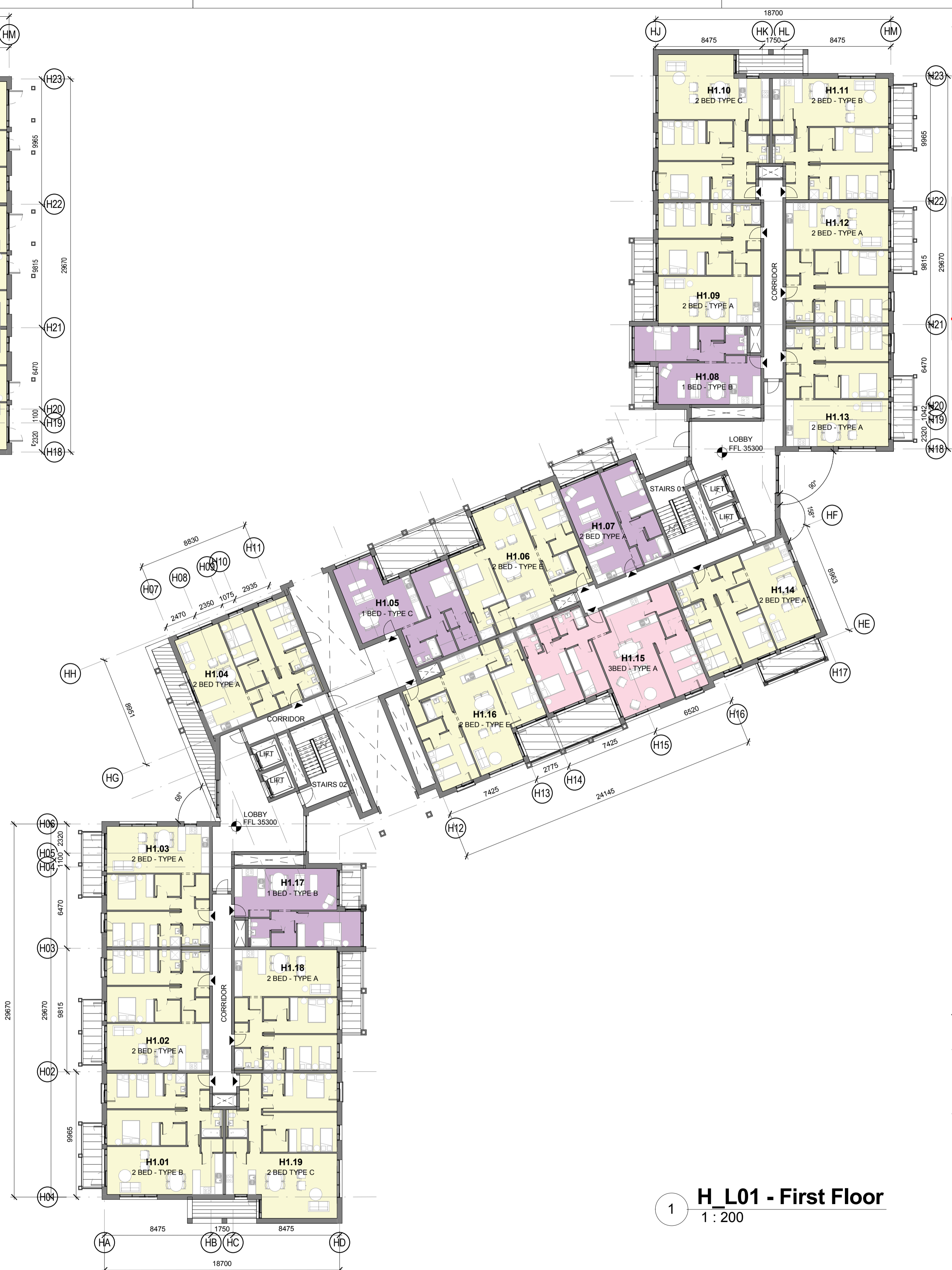
1 H_L01 - First Floor 1 : 200